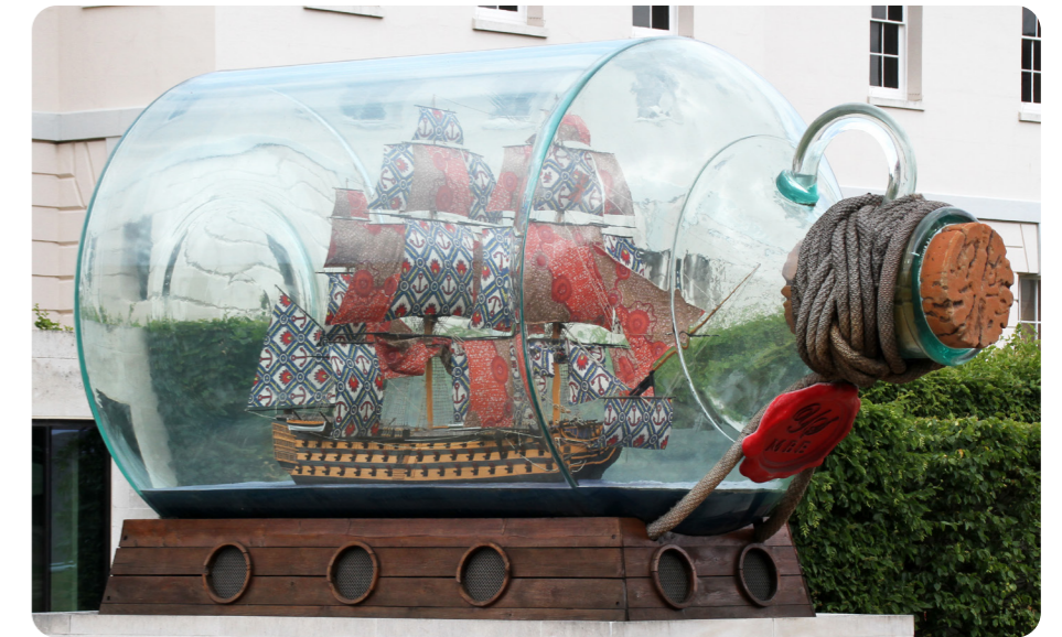
Nelson's Ship in a Bottle

Nelson's Ship in a Bottle (2010) by Yinka Shonibare was the first commission for Trafalgar Square by a black artist. It symbolises and celebrates the story of multiculturalism in London.