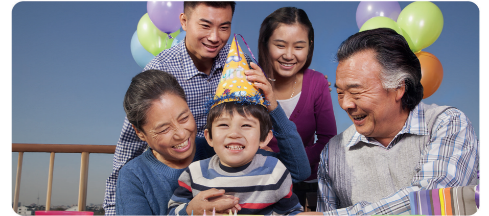
Birthdays happen every year.

Important life events include birthdays, religious festivals or family celebrations. Some life events happen every year and some happen at certain stages of human life.