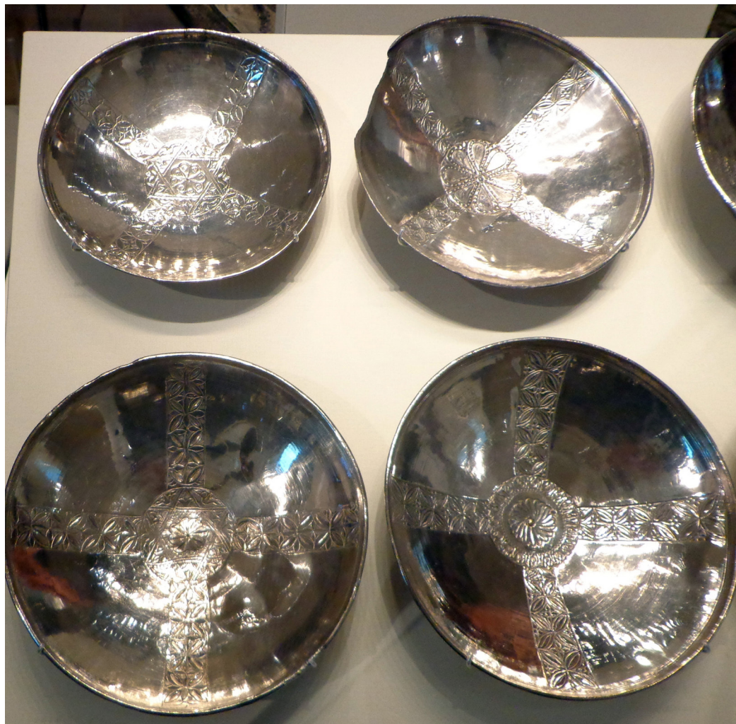
Byzantine silver bowls

These are two examples of the precious grave goods found in the burial chamber of the Great Ship Burial.