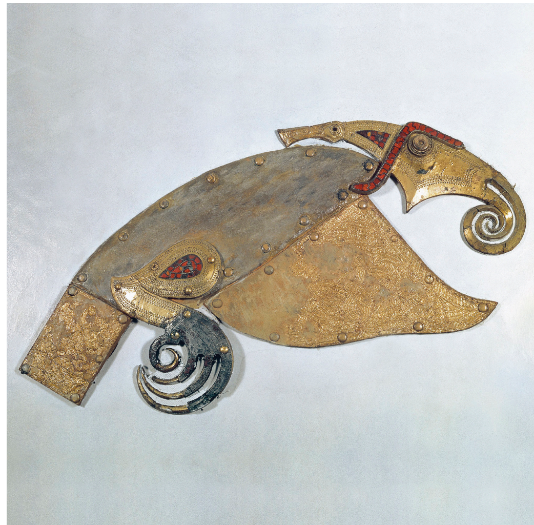
Shield ornament shaped like an eagle