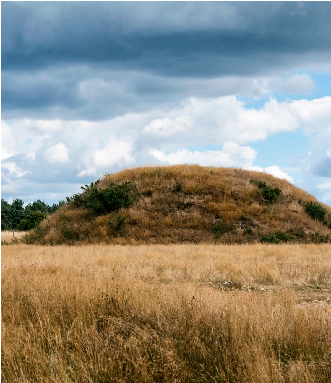
Barrow at Sutton Hoo

Around 18 burial mounds, called barrows, are within the royal burial ground at Sutton Hoo, but many have eroded over the centuries. Archaeologists believe that, at one time, there were probably more.